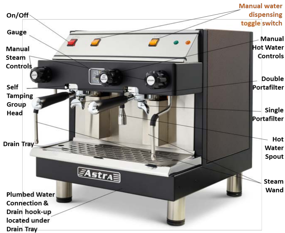
FIGURE 3: AUTOMATIC MEGA 1,2,3